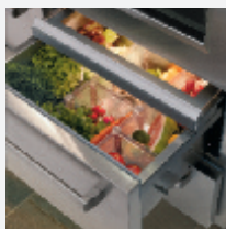
Glass crisper lid.