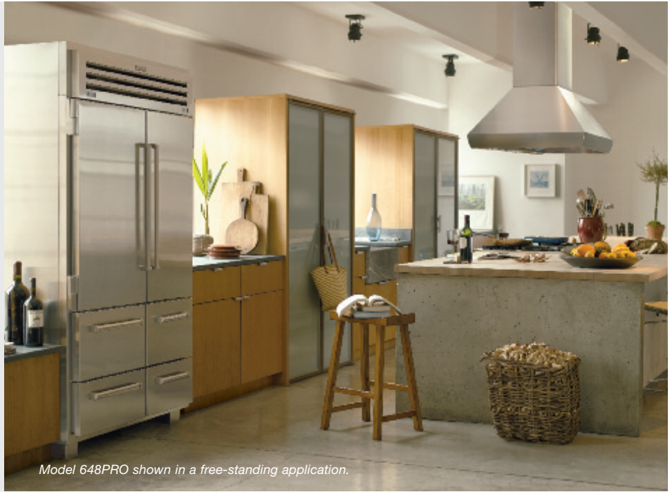
Model 648PRO shown in a free-standing application.

Born of 100% steel (and a good bit of bravado), model 648PRO is a true masterpiece of preservation. Its sculpted metal, dual refrigeration with three evaporators and advanced controls marry performance and design in a bold new way for home refrigeration. So it not only keeps foods magnificently fresh, it brings the whole kitchen tastefully up to date. Model 648PRO can be built-in or used in a free-standing application.