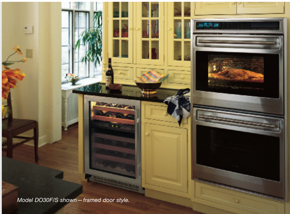
Model DO30F/S shown—framed door style.

Electronic controls hide behind a stainless steel panel. A motor quietly rotates the control panel into position. Both ovens of the Wolf L series built-in double oven feature the Wolf dual convection system. It delivers even temperature and airflow throughout the oven. Two fans and four heating elements operate either simultaneously or in sequence, depending on which one of the ten different cooking modes you choose.