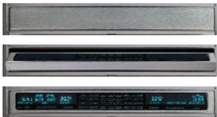
Rotating glass touch control panel.

This appliance is certified by Star-K to meet strict religious regulations in conjunction with specific instructions found on www.star-k.org .