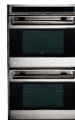
Model DO30U/S Unframed Door Style