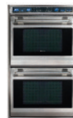
Model DO30F/S Framed Door Style

Accessories are available through your authorized Wolf dealer. For local dealer information, visit the find a showroom section of our website, wolfappliance.com .