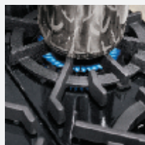
Dual brass burner.