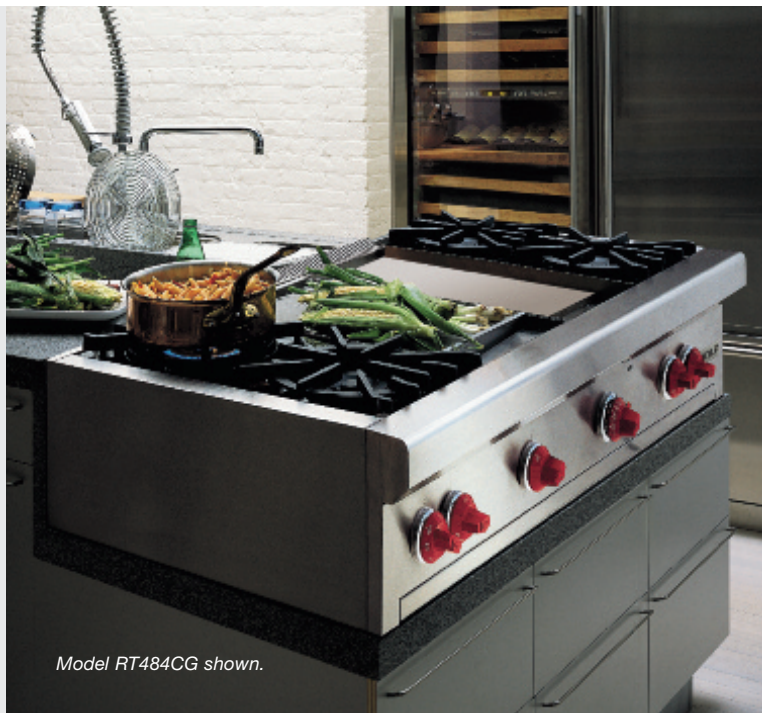
Model RT484CG shown.

Wolf gas rangetops offer that professional look but give you the flexibility to use ovens in other locations in the kitchen. Wolf gas rangetops offer standard features such as dual brass surface burners and our signature large red control knobs. Optional infrared charbroiler and infrared griddle give you the freedom to customize your gas rangetop. Wolf gas rangetops are available in natural or LP gas.