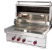
36" Outdoor Gas Grill REBATE $700