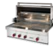
42" Outdoor Gas Grill REBATE $800