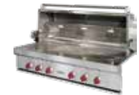
54" Outdoor Gas Grill REBATE $900