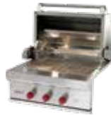
30" Outdoor Gas Grill REBATE $600