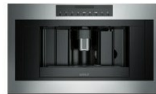
E SERIES PROFESSIONAL