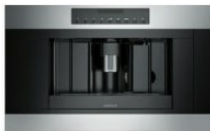
E SERIES TRANSITIONAL