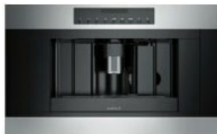
E SERIES TRANSITIONAL