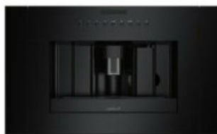
M AND E SERIES CONTEMPORARY