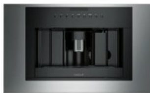
M SERIES TRANSITIONAL