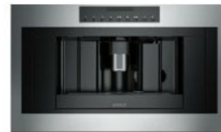
E SERIES PROFESSIONAL