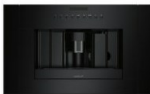
M AND E SERIES CONTEMPORARY