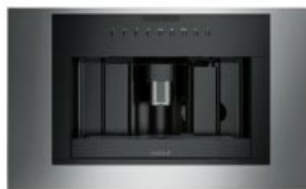
M SERIES TRANSITIONAL