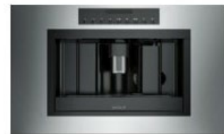
M SERIES PROFESSIONAL